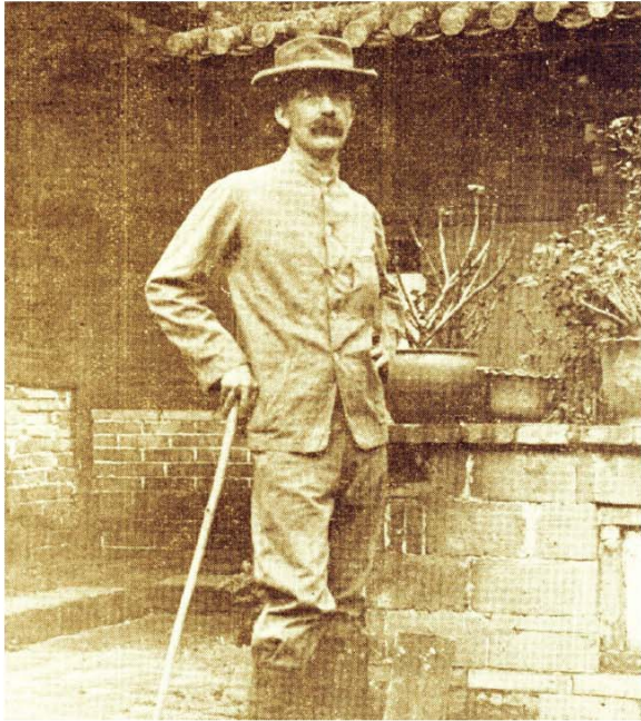
3 10 The famous plant collector from Co. Tyrone, Augustine Henry (1857-1930), discovered hundreds of Chinese species that became popular in European gardens.

This Red tour, to the river and back, features wildlife, plant hunting, phenology and philosophy.